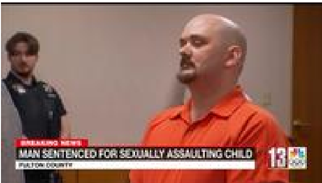
Johnstown man gets 20 years of life in prison for sexually assaulting child