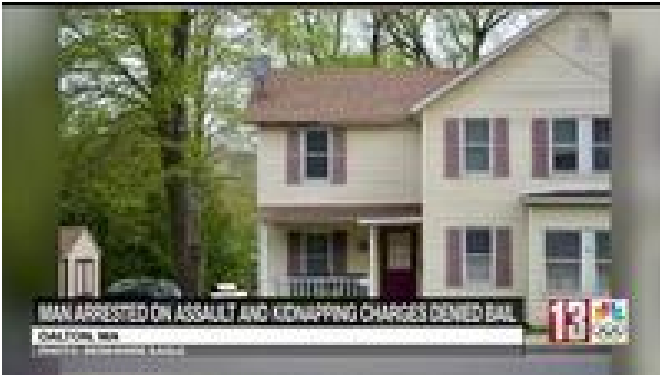
Mass. man charged in kidnapping, shooting denied bail